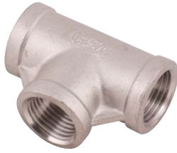
Equal Tees FEMALE / FEMALE