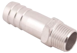
Reducing Hose Tails (Lump Ends)