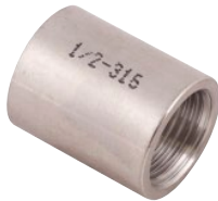
Equal Sockets FEMALE / FEMALE